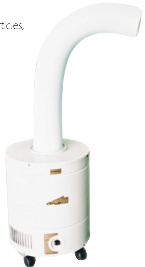
5000W - Vocarb

Also available: 5000 W-D with 22 lbs. of carbon